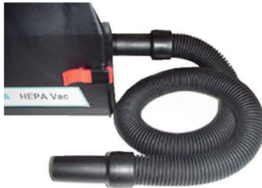
Figure 2: Attach Vacuum Hose to Vacuum

Attach the flex-hose securely to the front of the vacuum.