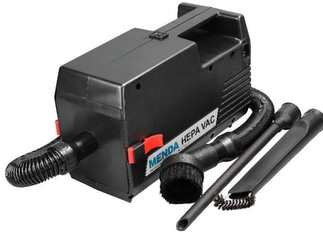
Figure 1: ESD SAFE HEPA Vacuum and Included Accessories