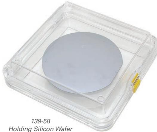
139-58 Holding Silicon Wafer