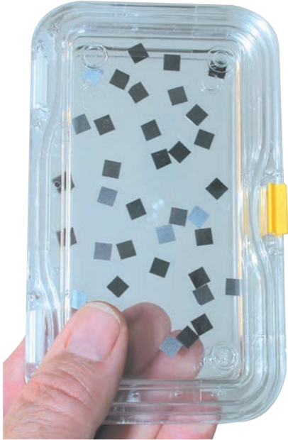
139-56 Holding Silicon Chips

Polystyrene plastic boxes with micro thin, flexible polyurethane membranes top and bottom. The plastic membranes form around the enclosed object and hold it securely. Small products or large may be held firmly within various box sizes. Semiconductor, machine parts, electron microscopy parts or materials, samples, and many other applications.